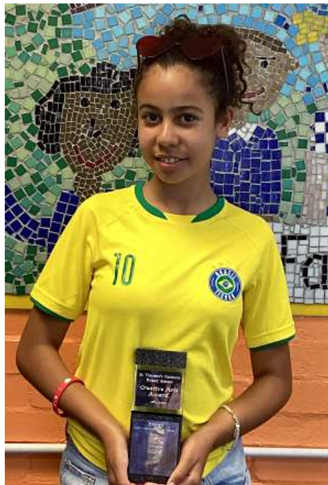
Alannis for Achievement in Creative Arts