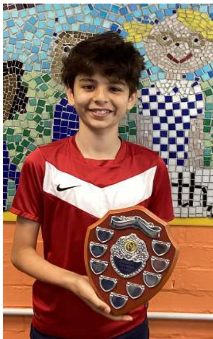
Valentino for Achievement in Religious Education