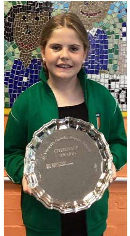
Polly for Achievement in Citizenship