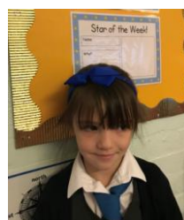
Year 1 – Violet